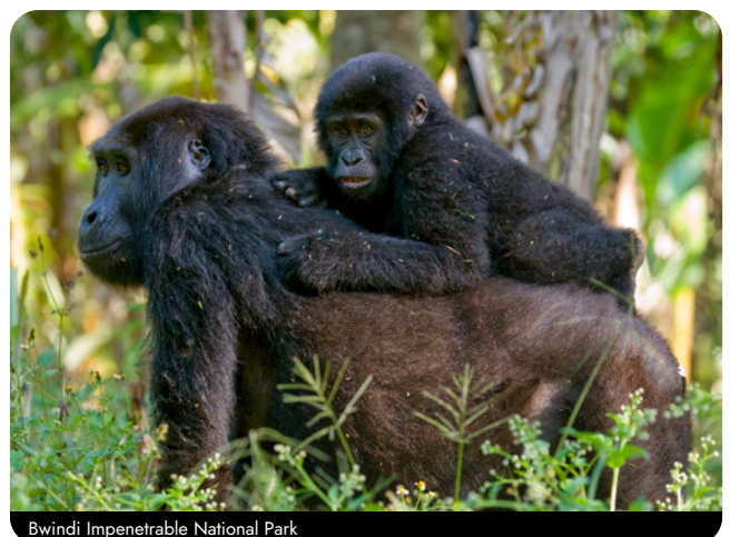
Bwindi Impenetrable National Park