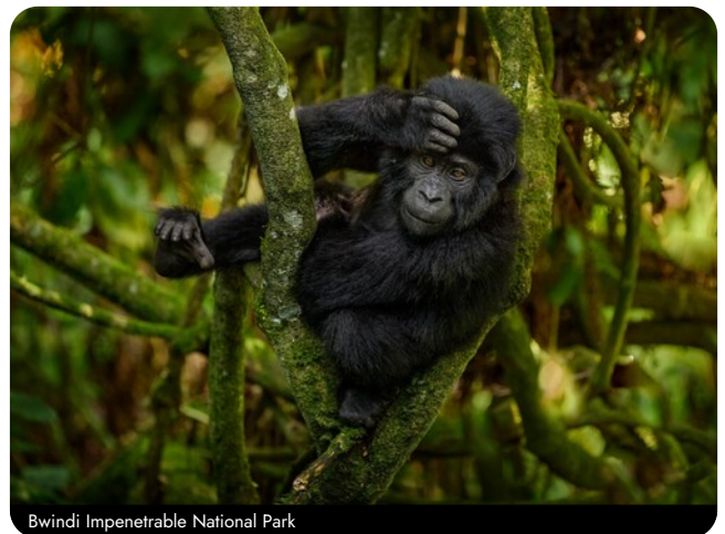
Bwindi Impenetrable National Park